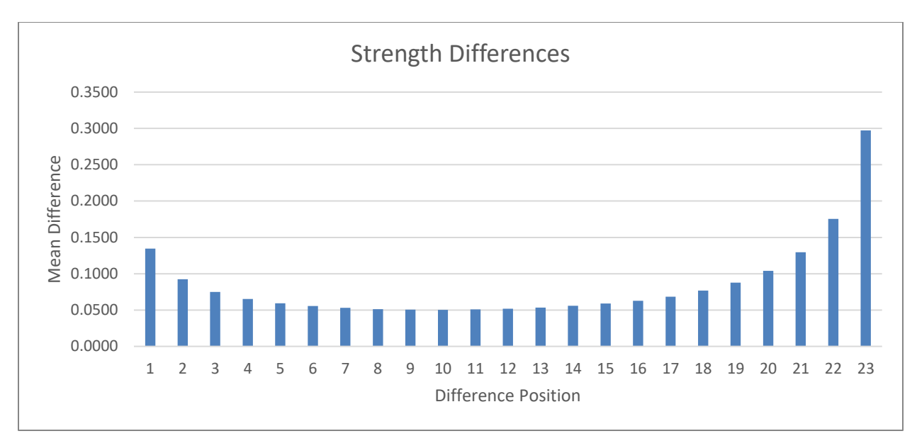
Figure 2. Mean differences between strengths by rank. Values represent the mean difference between the first two highest strengths, then the second and third highest, and so on.